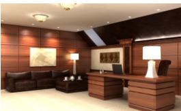
Interior Wood Surfaces