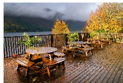
Exterior Wood Surfaces