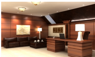
Interior Wood Surfaces